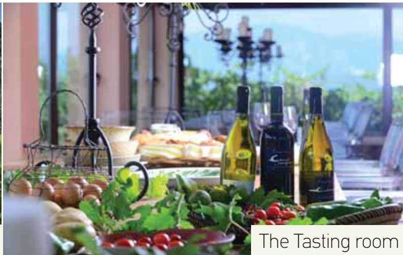
The Tasting room