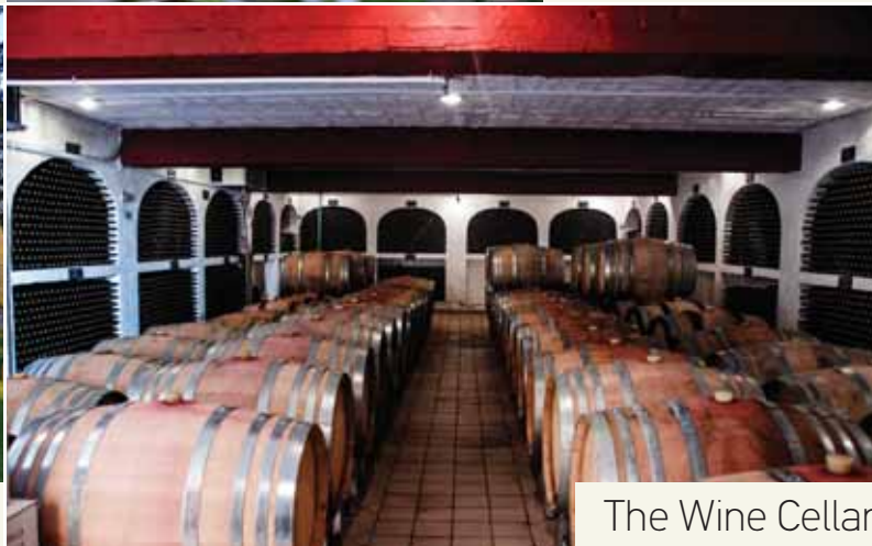
The Wine Cellar